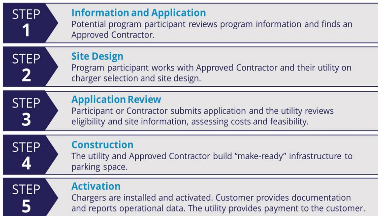
Table is provided for illustrative purposes. Individual utilities reserve the right to make determinations regarding incentive-level eligibility based on their best interpretation of the proposed project and available information at the time of review. Customers are responsible for charger costs, annual maintenance cost, and ongoing electricity costs.

Offsets infrastructure costs with regards to charging station site preparation. Can be used as match for ZEV Infrastructure Grant.